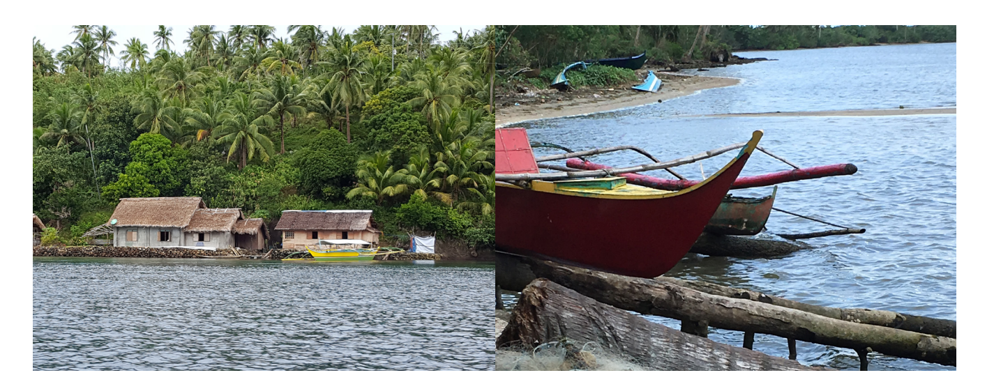
Fishing is one of the primary sources of livelihood for coastal and island communities.

Conversely, weak (or less inclusive) community engagement approaches focus on disseminating top-down information and gathering feedback on government proposals or issues through consultation via town hall meetings, surveys and committees. They tend to reflect normal business over time and lack willingness or knowledge to develop stronger approaches (Aldunce et al. 2016, Cavaye 2004, Hindmarsh 2012, Nkoana et al. 2017). Typically, they feature fragmented planning and policy processes that result in poor coordination and policy implementation. They perpetuate cultural barriers to participation involving cultural leadership, beliefs and perspectives; community marginalisation and lack of supportive resources (McMartin et al. 2018, Samaddar et al. 2015, Zafrin et al. 2014). The burgeoning international literature supports the view that strong community engagement is highly effective to address the interrelated social and environmental complexities of CCA and DRRM (e.g. Schlosberg et al. 2017, Tanwattana