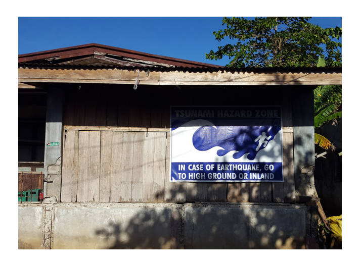
Information about tsunami warnings is placed in obvious places within the community.