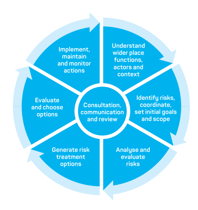
Figure 1: Charter for Fire Adapted Communities Practice - Note 1 process summary.