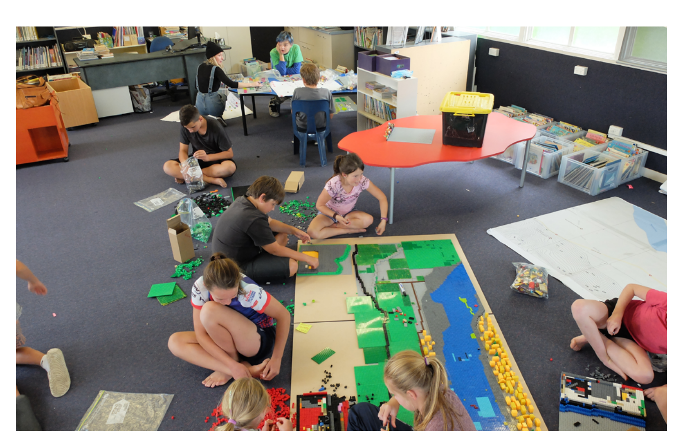
LEGO participatory mapping with children in New Zealand.

For Minecraft, the researchers produced a georeferenced and scaled Minecraft world that provided an initial spatial environment ready for students to map the local area and plot information they identified. This base layer included building outlines, elevations and other geographical features and characteristics such as roads and rivers. All geospatial input data was freely